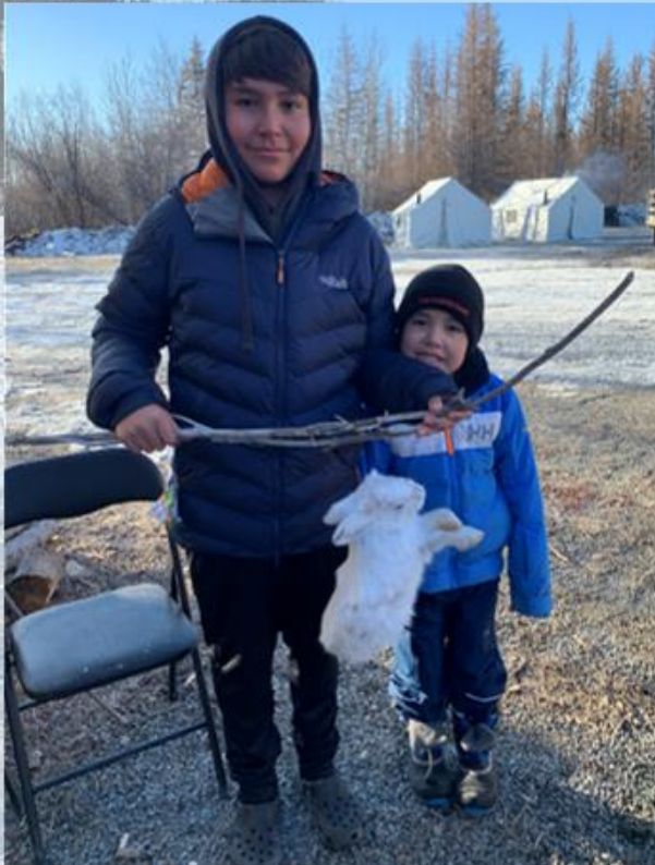
What they got from the rabbit snare!