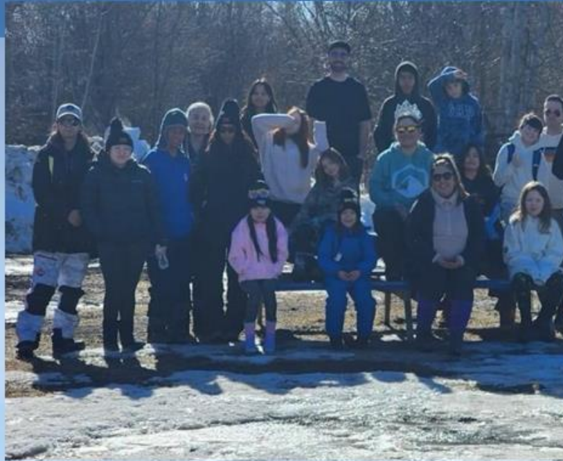
Group picture with the Rendezvous que