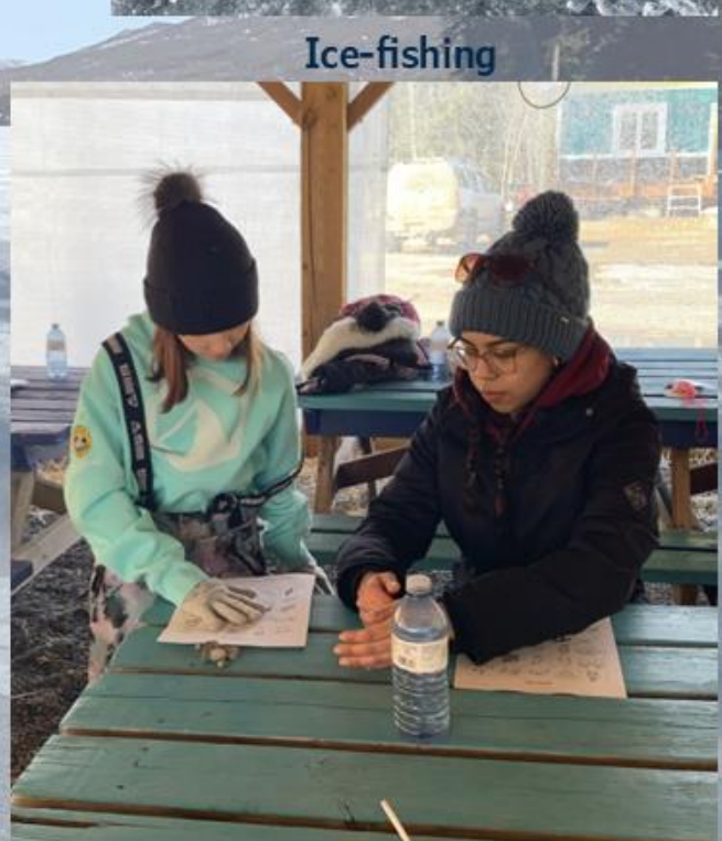
Playing Indian bingo