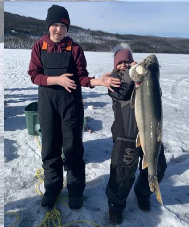
Posing with the big fish