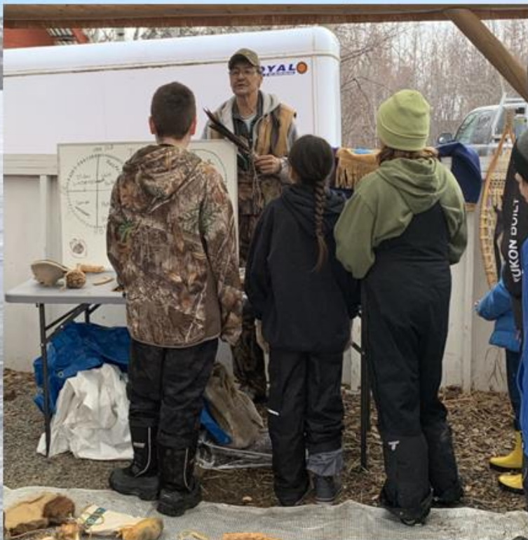
Learning about hunting