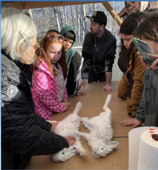
Cutting the rabbits