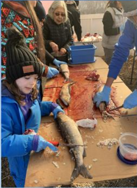
Learning to cut fish