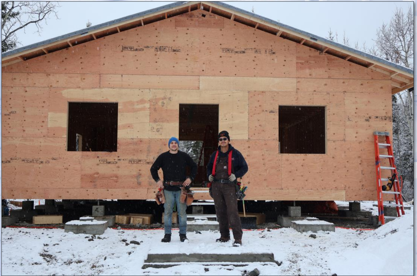
Construction for the new building at TKC's Fish Camp is nearing completion. The 30-ft by 40-ft building will include a new 20-ft by 20-ft commercial kitchen and a dining space for up to 50 people. The design also allows for expansion and future additions out the front which will include a deck area. Above, crew members from TKC-owned business TBL Developments take a break from their activities.