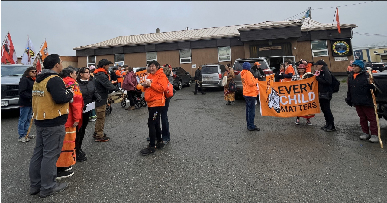
The Walking Warriors for the Lost Children started their journey on September 24 on the Tr'ondëk Hwëch'in Traditional Territory. On September 30, the Warriors were greeted at TKC's offices before marching to the ceremonies held at the Kwanlin Dün Cultural Centre. (below)