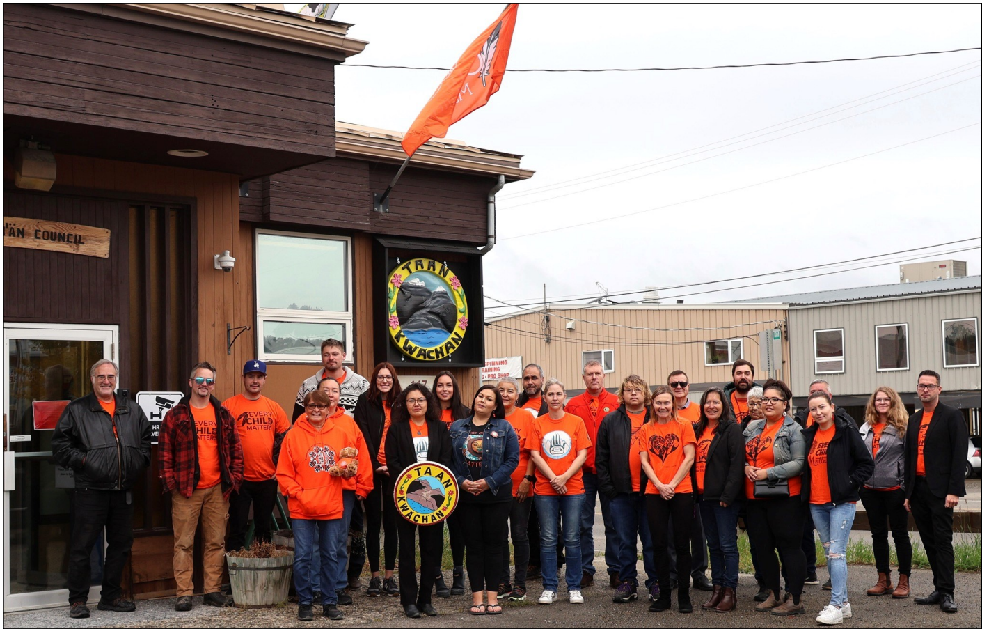
TKC Staff standing in solidarity and wearing orange to honour the thousands of survivors of the residential school system in Canada, and to the children who never made it home. Every Child Matters!