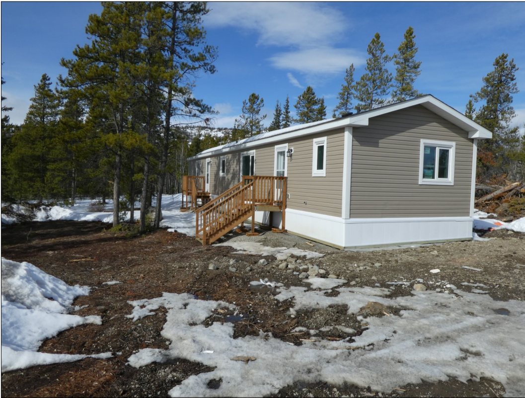
Unit 1 at the Lake Laberge site is a three-bedroom home now ready for occupancy.

TKC Housing & Infrastructure Department is pleased to announce the new addition of nine mobile units at Lake Laberge. With assistance from the tenant relations department at Da Daghay Development Corporation (DDDC) we were able to successfully gain occupancy and open the units up to nine Citizens. It is an extremely exciting achievement coinciding with our “Citizens First Housing Initiative.”