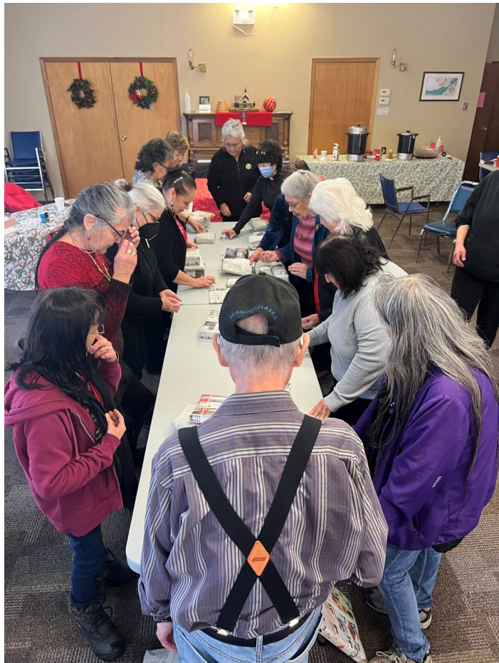
TKC Elders enjoy a game of Indian Bingo at the Elder's Tea held in December.

This year, the TKC Youth Council looks forward to connecting with Council to provide recommendations that will have positive impacts on all TKC Youth and to gather wisdom from the Elders Council. Youth Council has made connections with the Assembly of First Nations and anticipates conferences and travel being a large part of their 2023. Youth Council holds their meetings once per month and want to remind all TKC youth that they are welcome to observe the meetings.