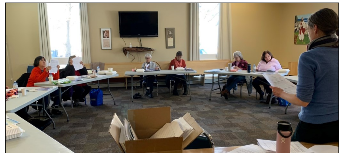
Special workshop on wills and estates.

The Elders Council also participated in a Wills & Estates workshop, learning about important aspects that need to be addressed when creating a will and estate management and planning. They look forward to having a lawyer draw up their wills in the coming months. They continue to receive updates from managers and outside contractors, allowing them to gain information about TKCs standing in various initiatives, including the Whitehorse Rapid Dam Relicensing Project and How We Walk with the Land and Water.