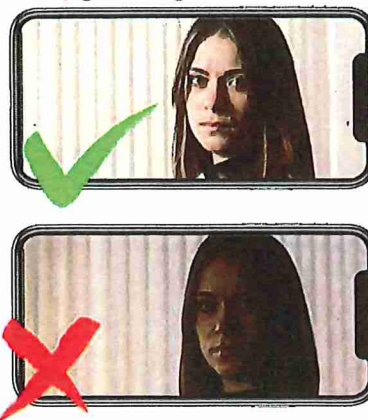
Avoid bright backgrounds or windows