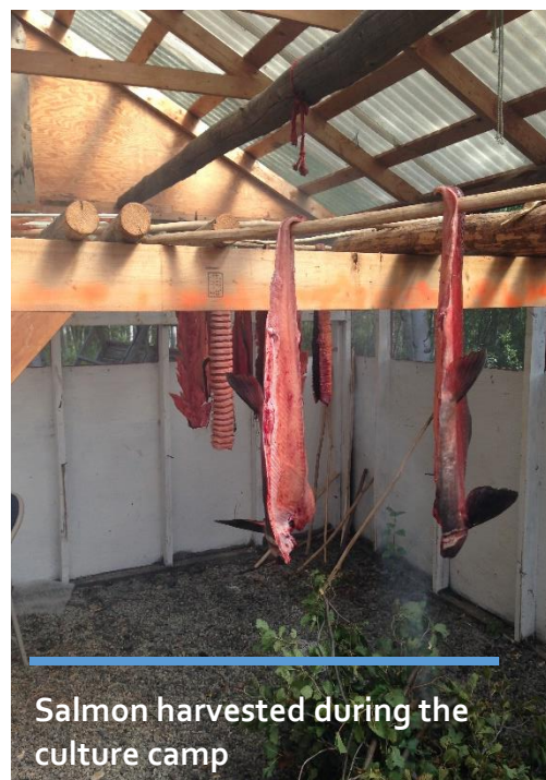
Salmon harvested during the culture camp