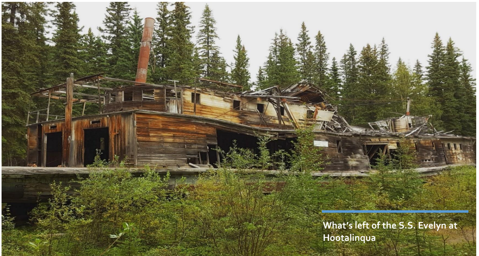
What's left of the S.S. Evelyn at Hootalinqua