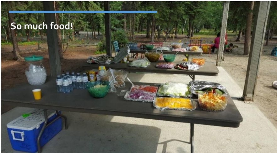
So much food!