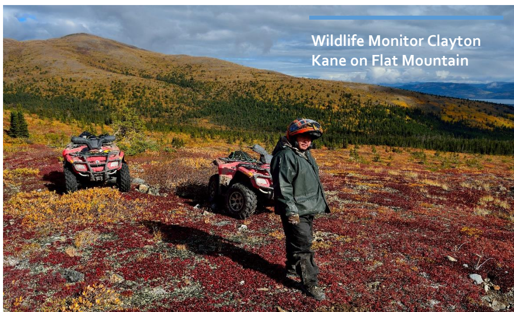
Wildlife Monitor Clayton Kane on Flat Mountain