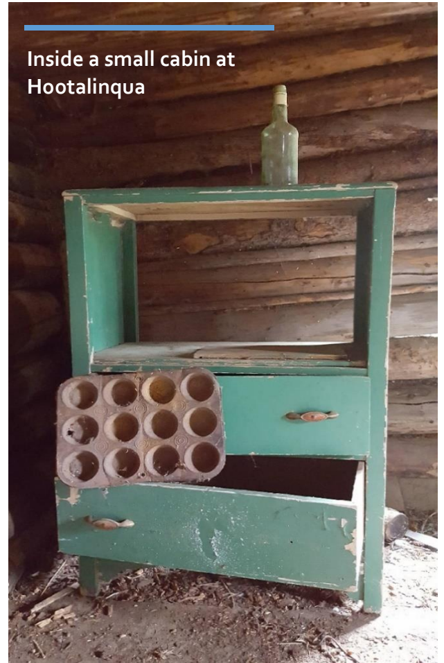
Inside a small cabin at Hootalinqua