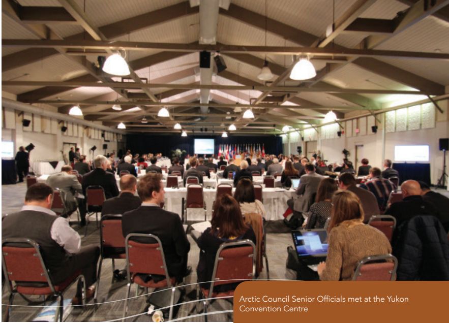
Arctic Council Senior Officials met at the Yukon Convention Centre