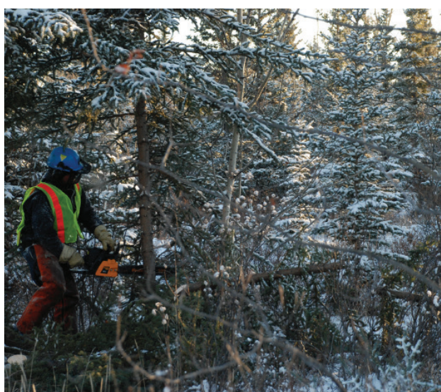
The FireSmart Project