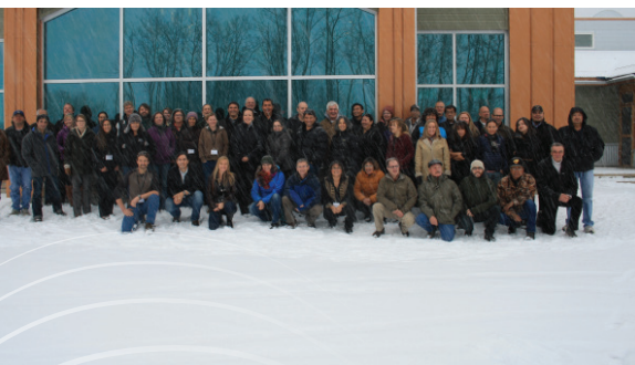
The YESAA Forum at the Da Ku Cultural Centre...read more on page 13