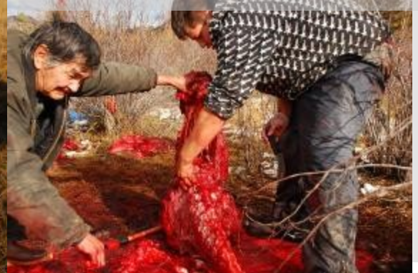
TKC First Annual Fall Moose Hunt Camp at Tl'aw Kwashän (Swan Lake)